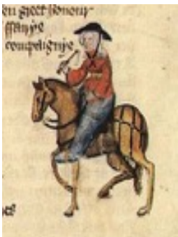
THE WIFE OF BATH